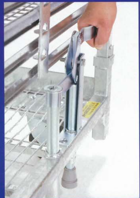
Our drop pin/braking combination keeps the carts safely in place while on the truck or at your customers.