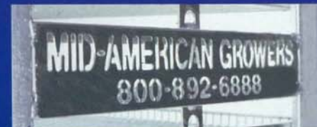
Our unique laser cut name plates are sure to add value in appearance and assist in cart identification.