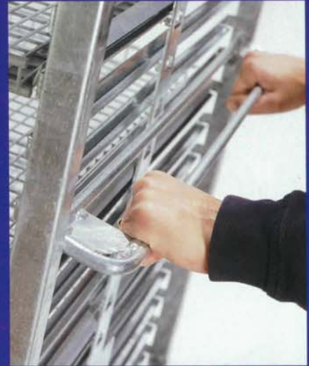
Cart can be easily maneuvered with our handles.

Karsten began manufacturing this cart in 2001. The unique cart design also maximizes shipping efficiency. The benefit of this cart is that it will collapse. This cart works well with other options such as laser cut plates and pull handles. Currently, this model is available in two sizes, ML 3143 and ML 3163.